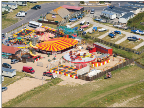
Funfair at West Sands, east of Selsey.