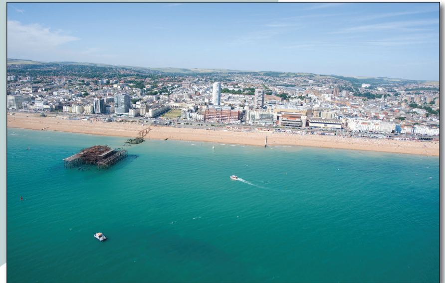
Where Hove meets Brighton, and the ruins of the old pier.