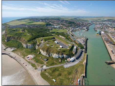
Newhaven looking along 'The Cut'. The fort, on the headland (left), was built around the 1860s.