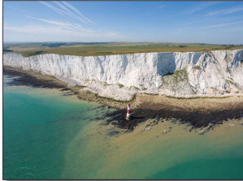
Beachy Head and the Seven Sisters.