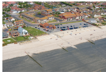
East Wittering. Left: West Wittering lies at the eastern mouth of Chichester Harbour.